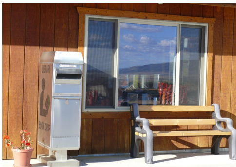
Book drop in Centennial, provided by the Friends of the Library